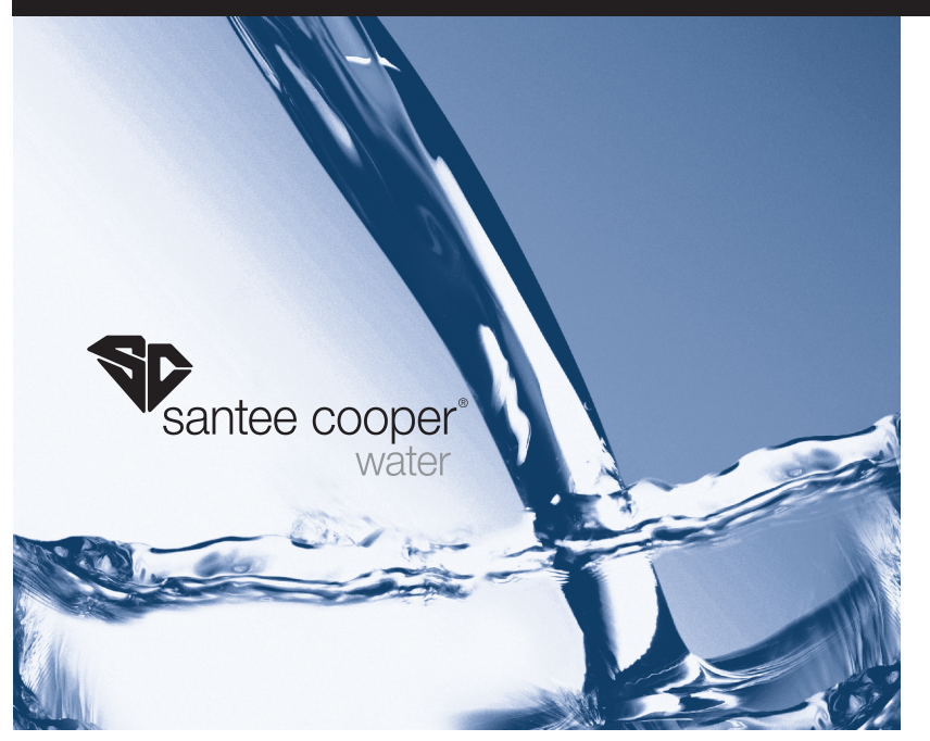
We're pleased to report that your water is safe and meets all federal and state requirements.